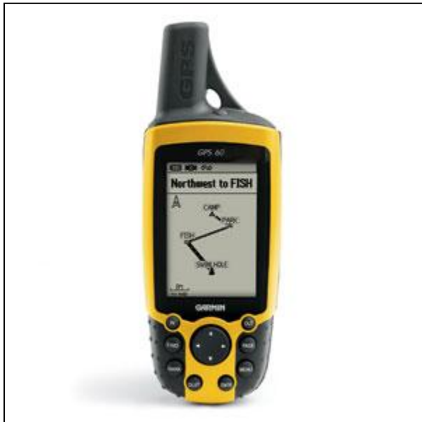
GPS 60 - *** Can't add maps GPS 72 - *** Can't add maps GPS 76 - *** Can't add maps