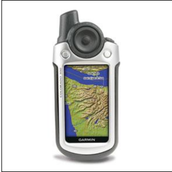
Colorado 300 Colorado 400 Colorado 400c, 400i, 400t