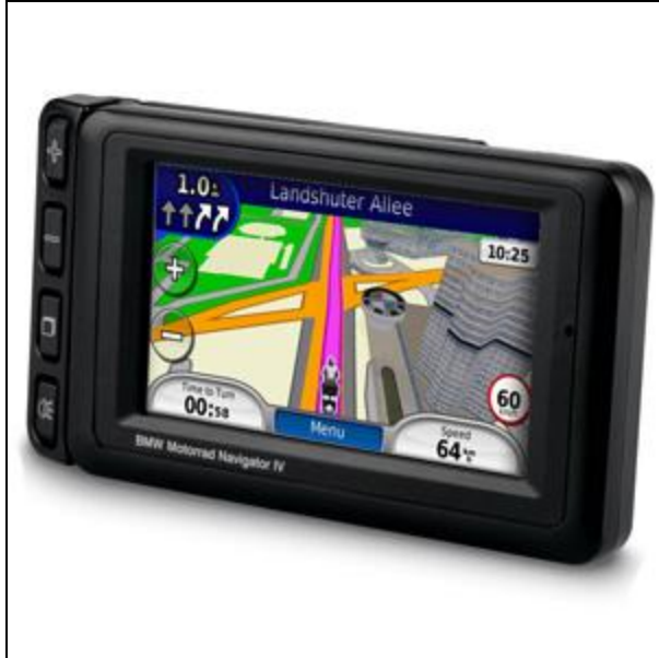
BMW Motorrad Navigator IV