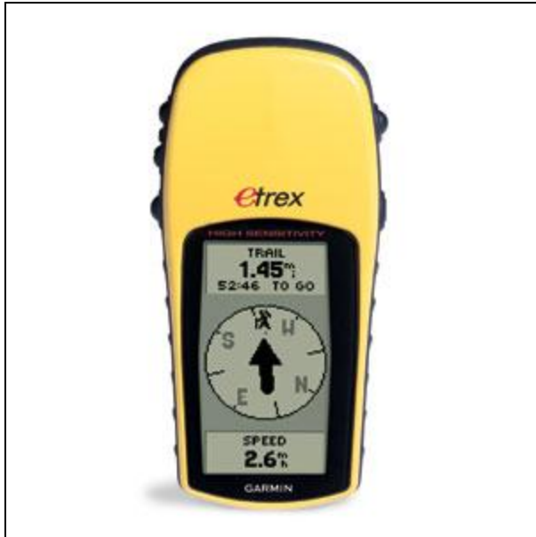
etrex H - *** Can't add maps