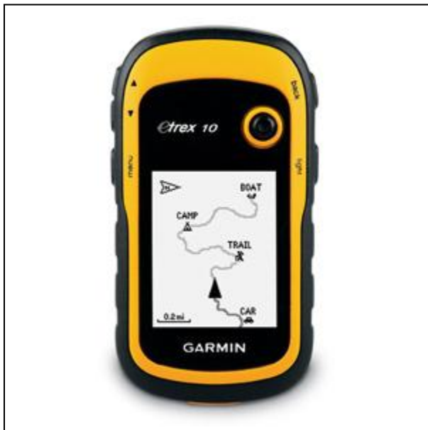
etrex 10 - *** Can't add maps etrex 20 etrex 30