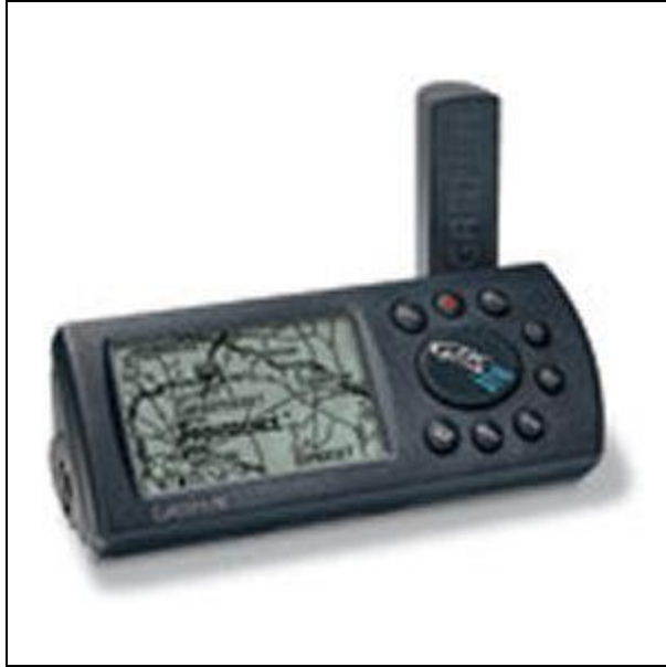
GPS II - Unknown GPS III - Unknown