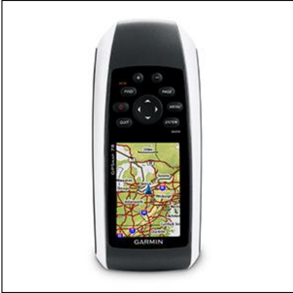
GPSMAP 78, 78sc