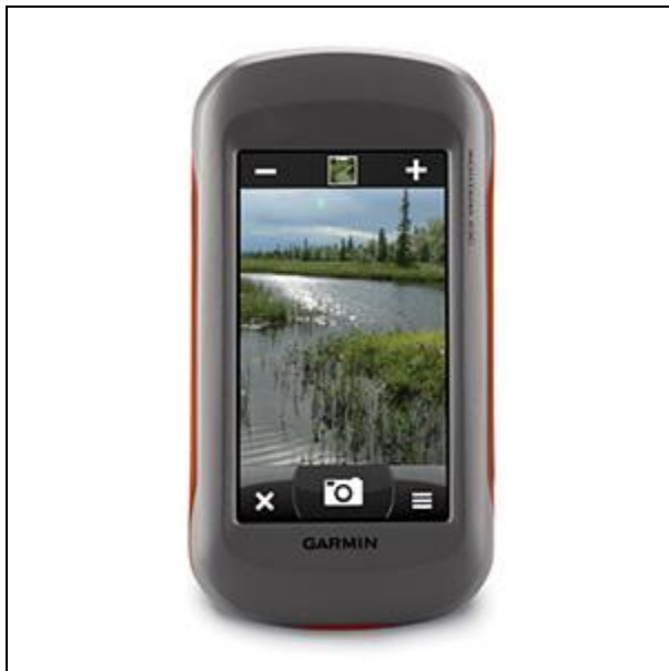
Montana 600, 610, 650, 680 (includes (T)opo models) Montana 700, 700i, 750, 750i