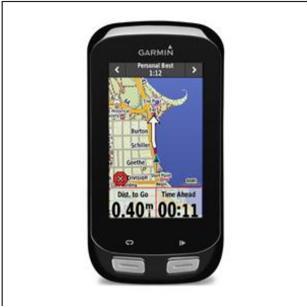
Edge 800 Edge 810 Edge 1000