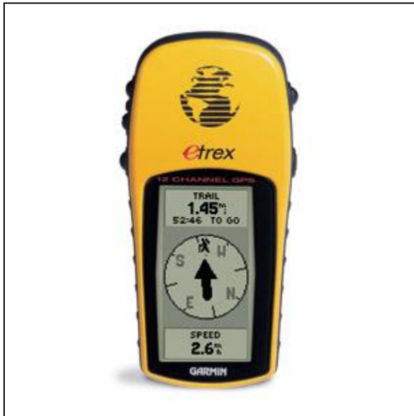
etrex "yellow" - *** Can't add maps