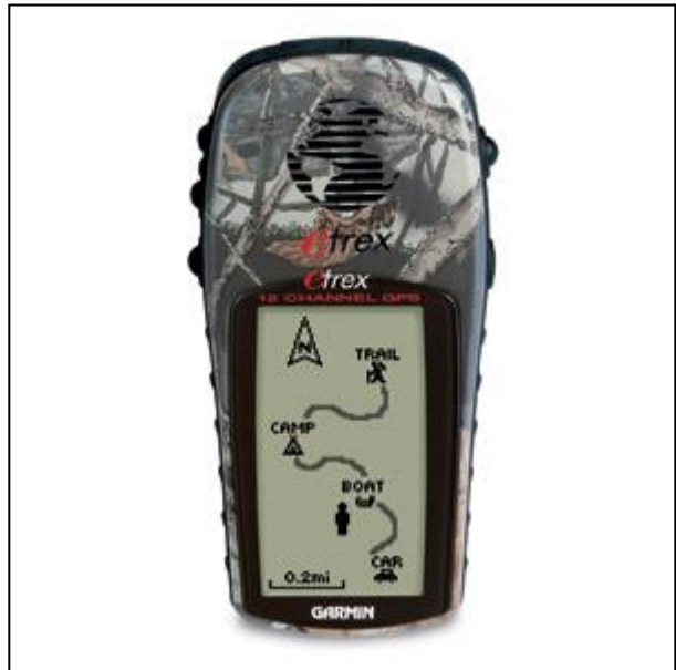
etrex Camo - *** Can't add maps