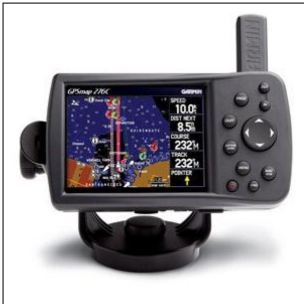
GPSMAP 276C GPSMAP 376C